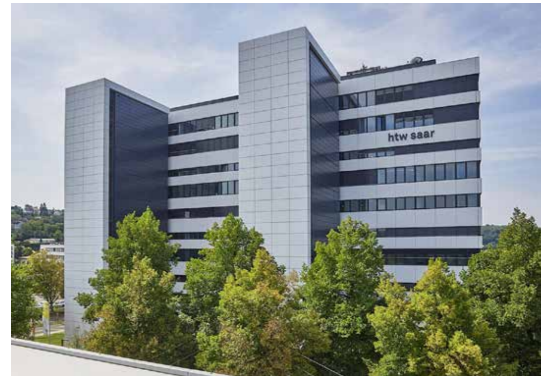
Located at the heart of Europe, University of Applied Sciences Saarland is one of the leading practice-oriented universities of Germany.

Consulting Service International (CSI) ist ein internationales Beratungsunternehmen mit langjähriger Erfahrung im Bereich Nachhaltigkeitsmanagement. CSI verfügt über praktische und direkte Erfahrungen auf den asiatischen Beschaffungsmärkten sowie einem umfangreichen globalen Partnernetzwerk. Das CSI Team umfasst erfahrenen Fachleuten und Consultants mit diversen Hintergründen, die vom Hauptsitz in Hongkong oder Vertretungen auf drei Kontinenten praktische Branchenlösungen in den Bereichen Nachhaltigkeit, Lieferkettenmanagement und Compliance entwickeln. Als Initiator der Partnership for Compliance arbeitet CSI mit verschiedenen Partnern an zukunftsfähige Lösungen mit Schwerpunkt auf Nachhaltigkeit, Innovation und Kommunikation.